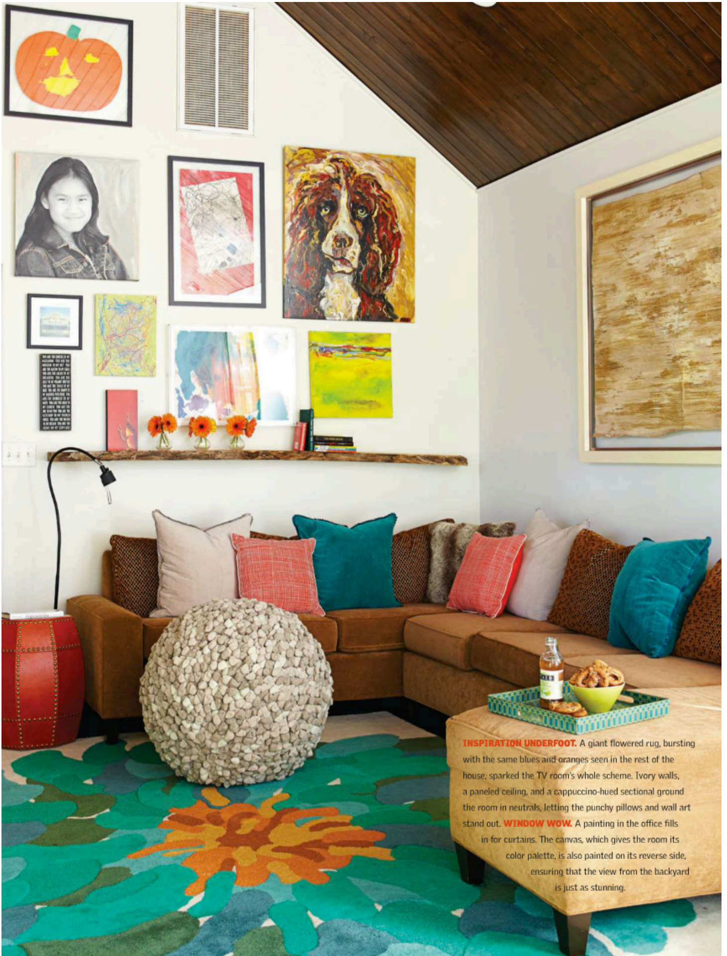
INSPIRATION UNDERFOOT. A giant flowered rug, bursting with the same blues and oranges seen in the rest of the house, sparked the TV room's whole scheme. Ivory walls, a paneled ceiling, and a cappuccino-hued sectional ground the room in neutrals, letting the punchy pillows and wall art stand out. WINDOW WOW. A painting in the office fills in for curtains. The canvas, which gives the room its color palette, is also painted on its reverse side, ensuring that the view from the backyard is just as stunning.