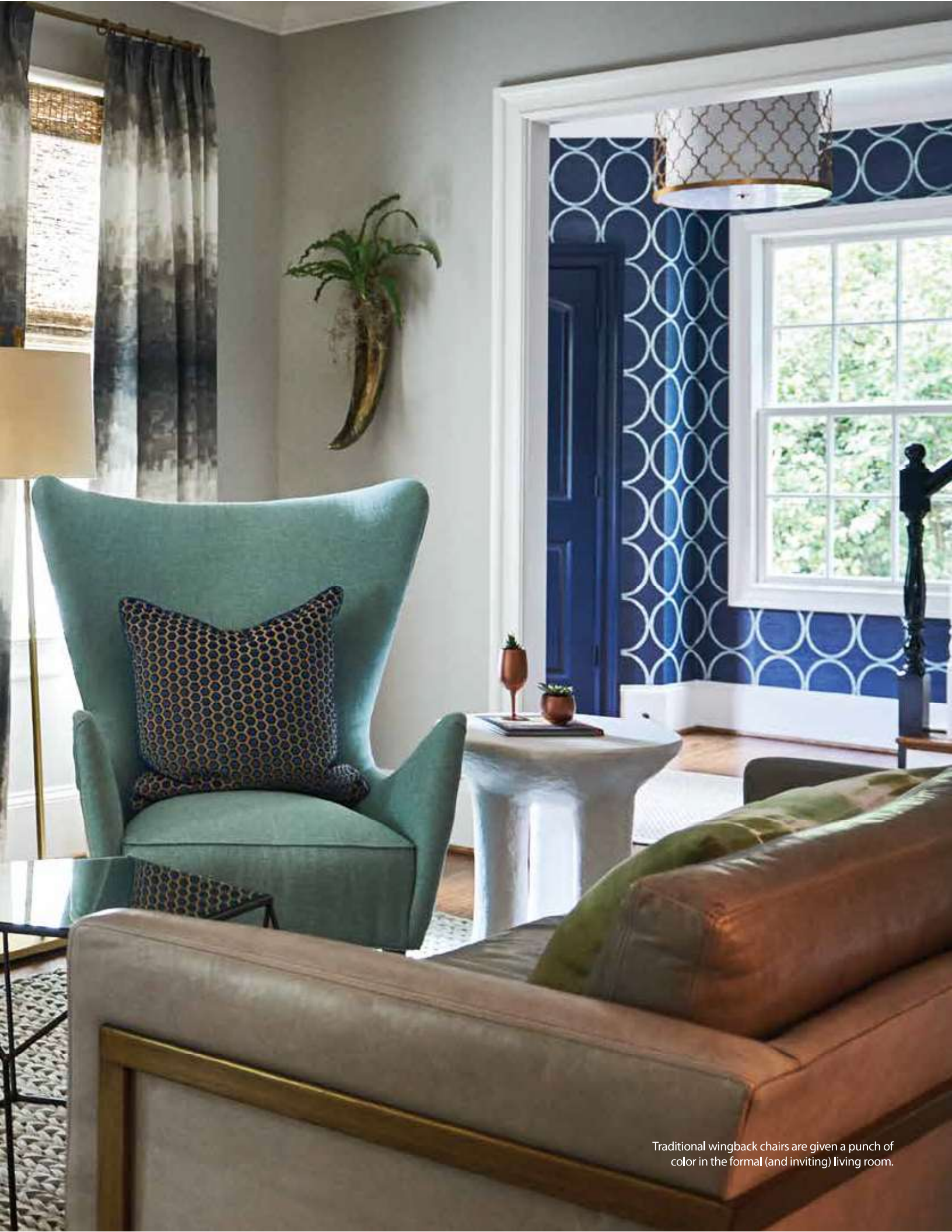
Traditional wingback chairs are given a punch of color in the formal (and inviting) living room.