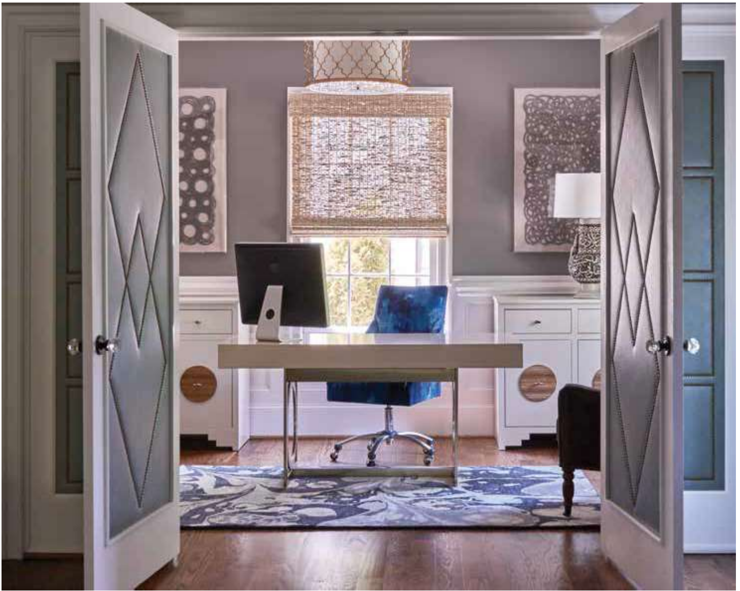
Top: Upholstered French doors provide elegant privacy to a modern home office.