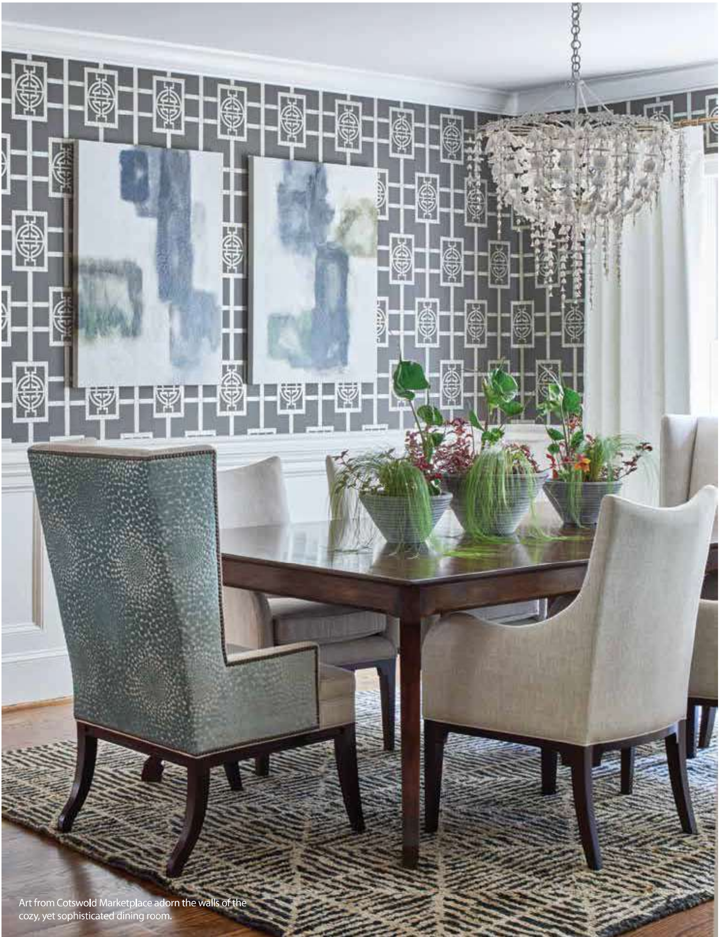
Art from Cotswold Marketplace adorn the walls of the cozy, yet sophisticated dining room.