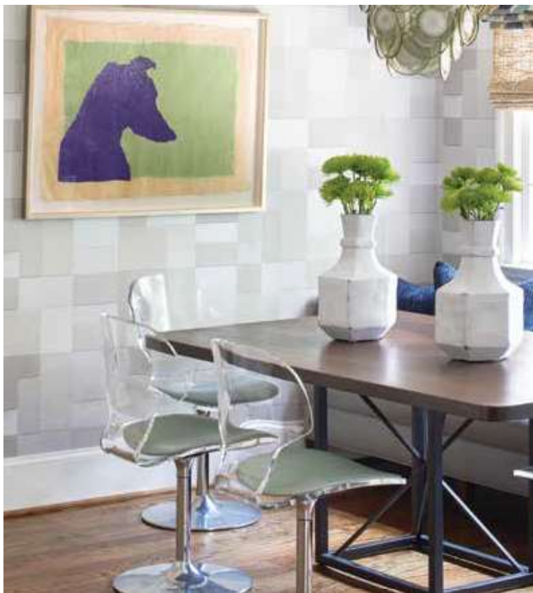
Right: Funky neutral wallpaper, a stunning fixture and a space-saving banquette is “everything” in this perfect breakfast nook. Bottom Left: Funky wallpaper and a bench seat perfectly highlight this small alcove Bottom Right: Accessories from Slate and Cotswold Marketplace, among others, add personality to every corner of the home.

Keim even upholstered some French doors that lead into an office for extra privacy. “The living room leading