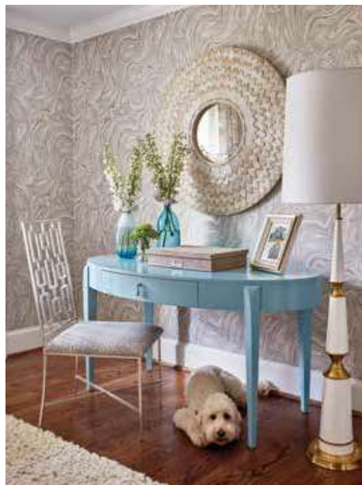
Top: The master bedroom is a soothing neutral haven with a design-heavy flair found in pops of turquoise and paper covered walls. Bottom Left: The Kelly Wearstler chandelier pairs beautifully with the rug from Stark Carpet to create a stunning, but soothing master bathroom space. Bottom right: A colorful dressing table in the master bedroom is the perfect spot to sit down and take off the day before bed.