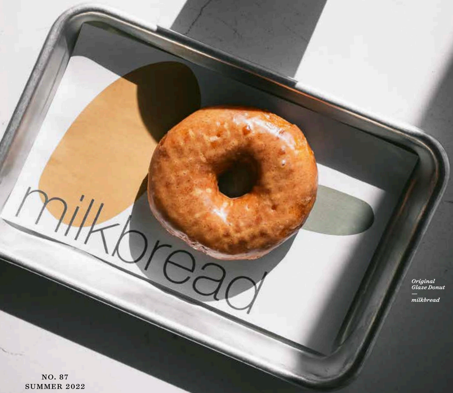
Original Glaze Donut — milkbread

The Best New Restaurants You Have To Try.